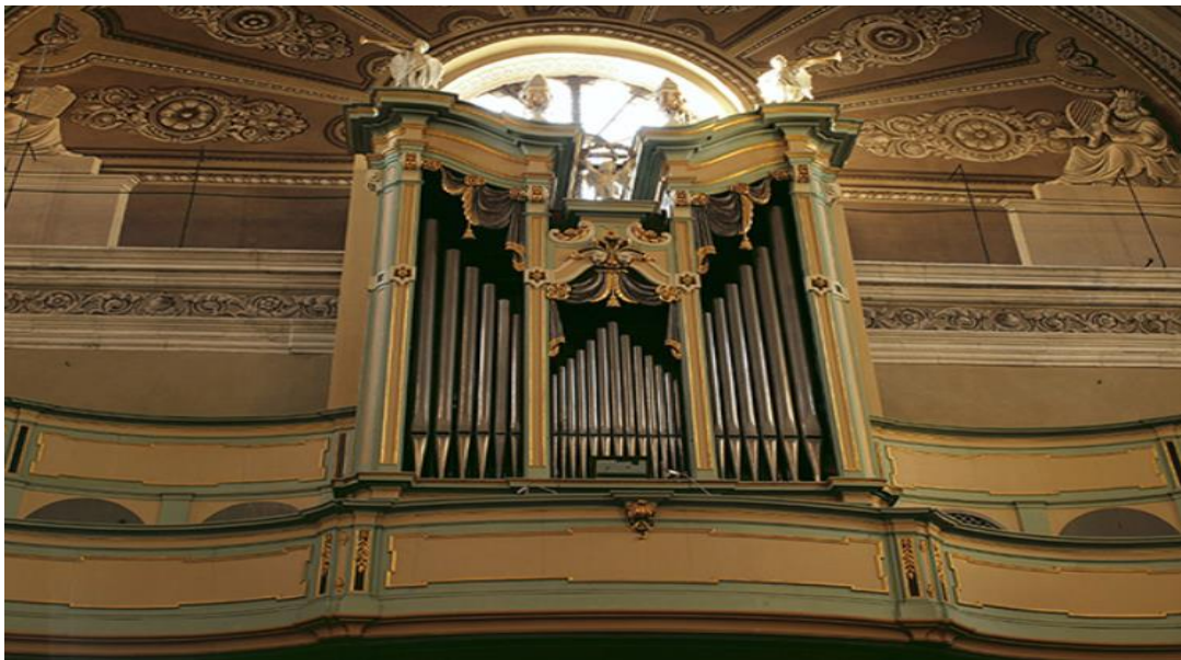
The ancient Antegnati Organ (1588) in the Collegiata Church of Bellinzona

Also owned by the City of Bellinzona and of inestimable value, the prestigious Antegnati Organ in the Collegiata Church is the second oldest organ in Switzerland after the one - dated 1430 and therefore the oldest organ in the world - in the Basilica of Valère in the city of Sion.