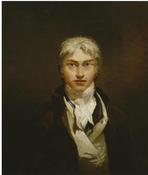
William Turner, Self-Portrait (c. 1799)

A member of the Romantic movement, Turner began painting at the age of ten. In 1789, he entered the Royal Academy of Arts School. His style laid the foundations for the birth of Impressionism and was a forerunner of Abstractionism.