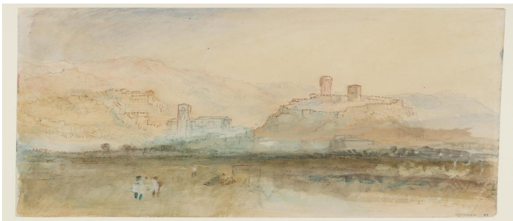
William Turner, Bellinzona from the North (1842 or 1841), © Tate Gallery , Tate London

In the context of the first edition of BELLINZONA CASTLES & GO (Sunday 29th May 2022), a cultural banner dedicated to Turner was placed at approx. KM 4.5 of the RUNNING RACE route - which is also part of the WALKING/NORDIC WALKING RACE route - at a point where the direct (frontal) view of the castles of Sasso Corbaro, Montebello and Castel Grande and the historic centre of Bellinzona recalls that immortalised in 1842 (or 1841) by William Turner himself in his watercolour Bellinzona from the North . Purpose: to inform and make race participants aware of the historical presence, on several occasions, of William Turner in Bellinzona and the great interest that one of the most important and celebrated painters of all time took in Bellinzona itself.